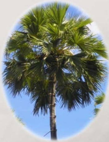
A lontar palm in Maubara

Several types of palm trees grown in the coastal, river flood plains and altitude up to 1,000 metre provide useful raw materials for the weavers. Commonly, leaves from the pandanus ( Pandanus tectorius or Heda in Tetum), lontar palm ( Borassus flabellifer or Akadiru in Tetum), the sago palm ( Corypha utan Lam. or Ai tali in Tetum), aren palm ( Arenga pinnata or Ai tua metan in Tetum) are used to weave into a wide range of basket wares.