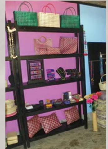
A range of modern basket wares on display for sales in Maubara