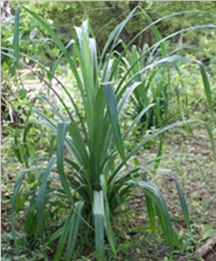
Young pandanus grown in the bush next to the Valu Sere Eco- lodges in Tutuala

today as can be seen from the range of basket wares in Maubara.