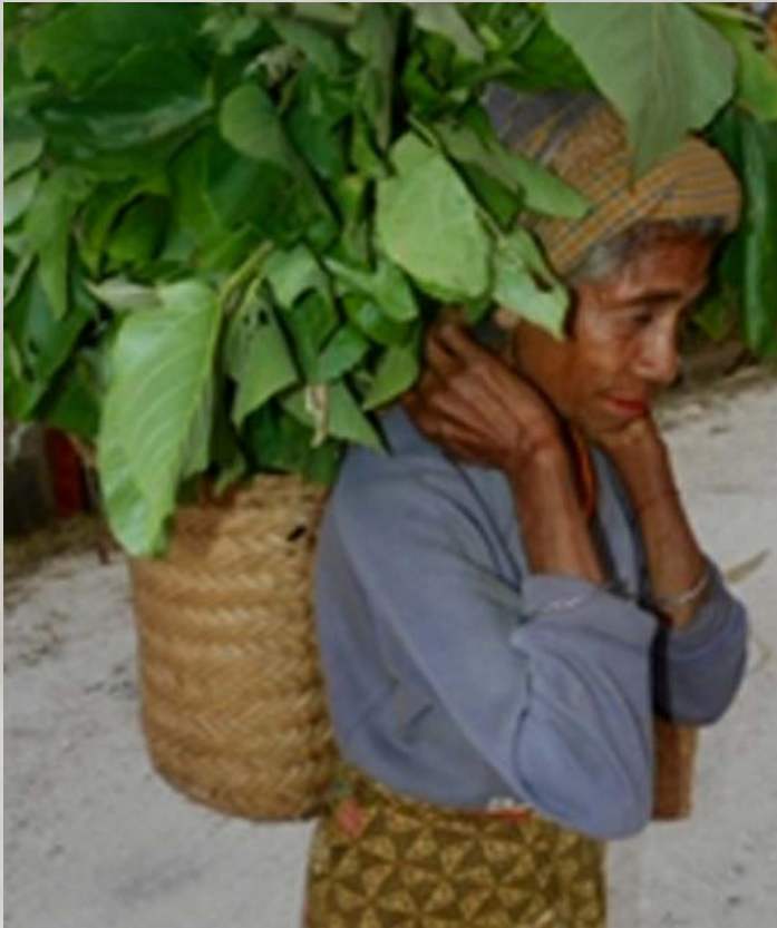
Mulberry leaves in the basket to feed the buffalos