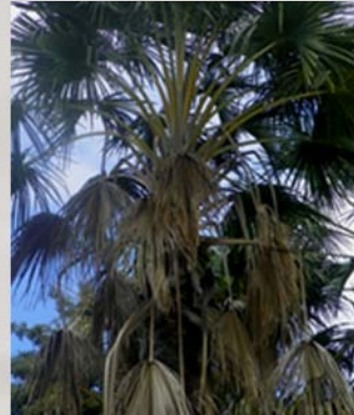
A Tali Metan (sago palm) in Hera

Basket weaving particularly thrives well in the coastal region where a wide range of palms grow naturally. Aren palm can be found in altitude up to 1,000 metre. Basketry continues to thrive from the ancient time due to its combined aesthetic art form and the wide range of practical uses of baskets wares for the people. These qualities have helped the art to survive and to evolve and change with time whilst preserving the technique that has been passed down from one generation to another since ancient time.