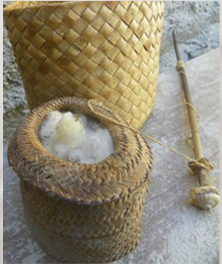
Baskets used for storing cotton wool to be spun into threads for the making of tais (Timorese woven material)

Baskets may be carried on the shoulder, the head or in the hand, as well as hung on the end of a stick that is balanced over the shoulder. Larger ones are usually worn on the shoulder or on the head for support or strapped on to the back. Medium-sized ones – are suspended over the back attached with long straps that wrap across the forehead, while small ones are carried in the hand.