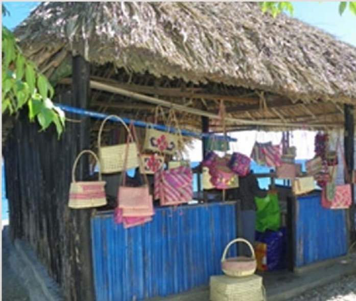
The Maubara Fort Sovenir Shop and Community Stall across the road

The widest range of basket wares and plant-based woven items can be bought from the stalls opposite the Dutch Fort in Maubara town about an hour and a half drive from Dili, pending on road conditions.