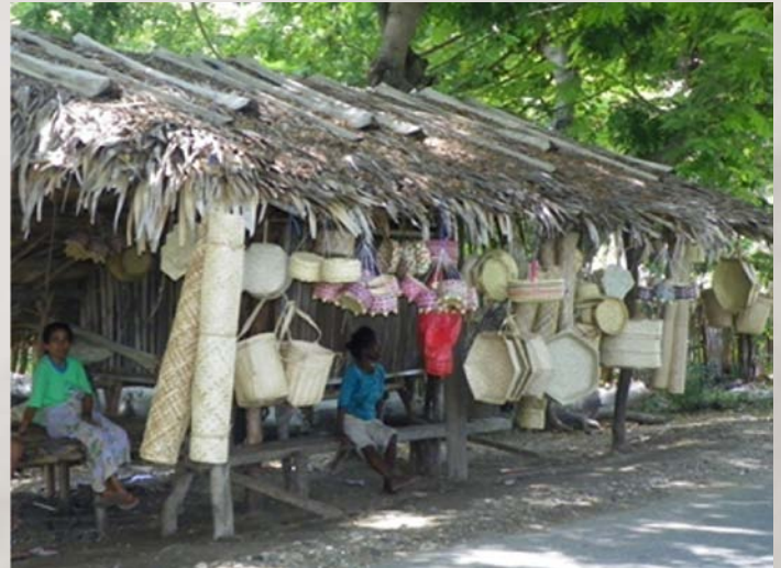
A road-side stall at Mau Liu selling a wide range of more traditional basket wares