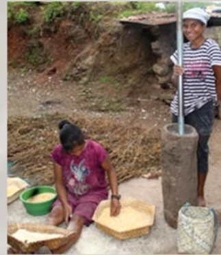
Baskets of corn and corn meals.