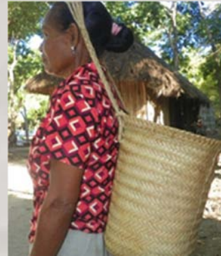
A baby carrying basket

Baskets may be carried on the shoulder, the head or in the hand, as well as hung on the end of a stick that is balanced over the shoulder. Larger ones are usually worn on the shoulder or on the head for support or strapped on to the back. Medium-sized ones – are suspended over the back attached with long straps that wrap across the forehead, while small ones are carried in the hand.