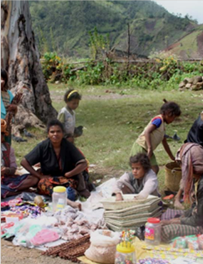
A stall selling homemade basket wares and other goods in a rural market