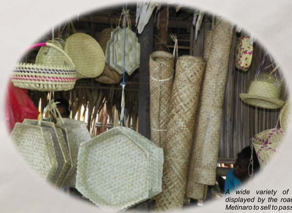
A wide variety of baskets displayed by the road side in Metinaro to sell to passers-by

Larger pieces of items made using similar weaving techniques are often used for furnishings such as mats. Baskets made of tougher materials are used to carry heavy items including babies and firewood.