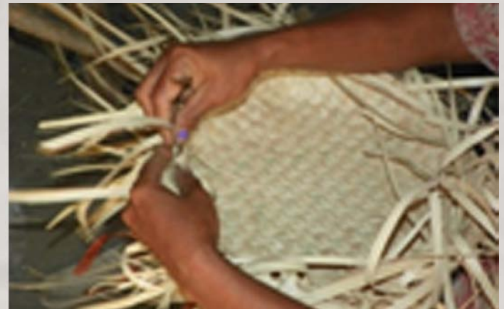
Women weaving baskets in Maubara